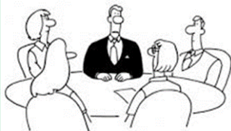
"Wow! That was close! We almost decided something!"